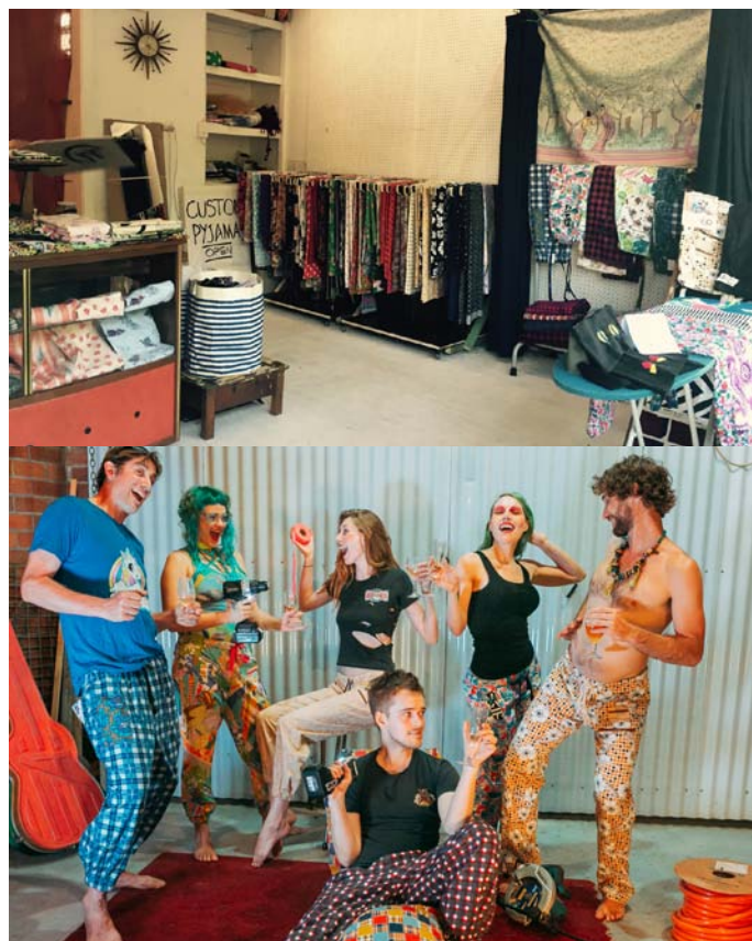
HELLO SHINY POP-UP PJ SHOP ~ bottom photo Lazybones

Whaddaya reckon? If you have stuff to sell and can spare one day to man the store, please get in touch. If enough people want to get on board with this concept, we are happy to host it.