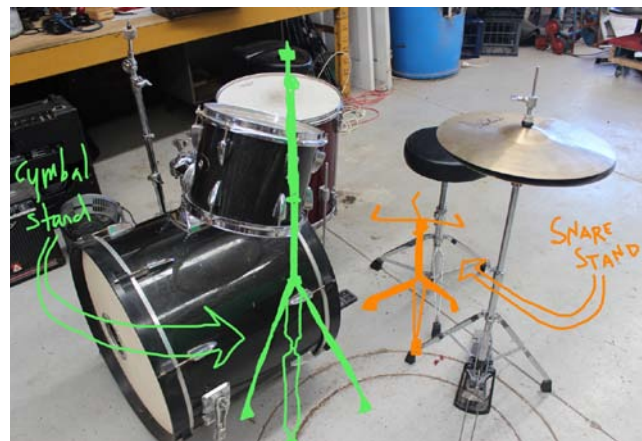
SOFTYS DRUM KIT