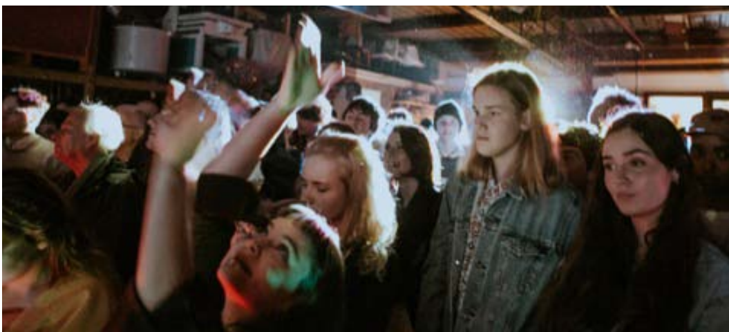
ABUNDANTINA LAUNCH JUNE 2018

We are seeking somebody to volunteer to be our Membership Officer. This role would involve encouraging membership, chasing fees, updating the database and fielding membership enquiries. A smart bossy bunch of kids might be good in this role!